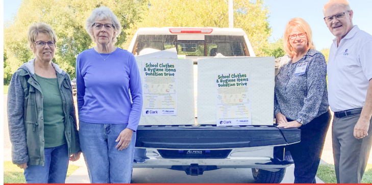
All Clark Offices donated 306 lbs. of hygiene products in partnership with McLaren Northern Michigan and nonperishable food for students in the Cheboygan-area.